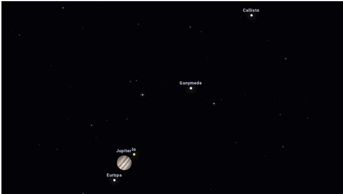
The Jovian system: Europa, Io, Ganymede, and Callisto.

The King of the Planets might not have the most moons, but four of Jupiter's 95 moons are definitely the easiest to see with a small pair of binoculars or a small telescope because they form a clear line. The Galilean Moons – Ganymede, Callisto, Io, and Europa – were first discovered in 1610 and they continue to amaze stargazers across the globe.