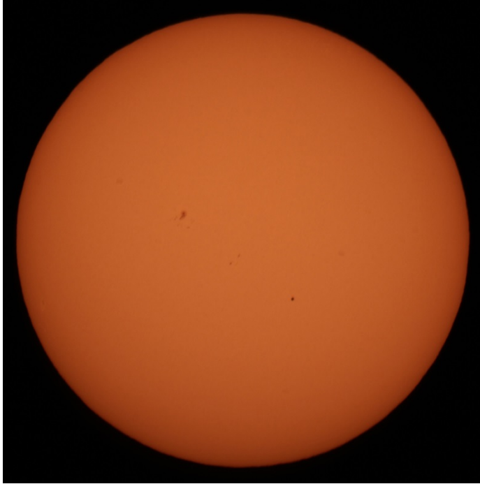
Photo of the May 9, 2016 transit of Mercury. Mercury is the small dot on the center right. Note how tiny it is, even compared to the small sunspot on the center left.