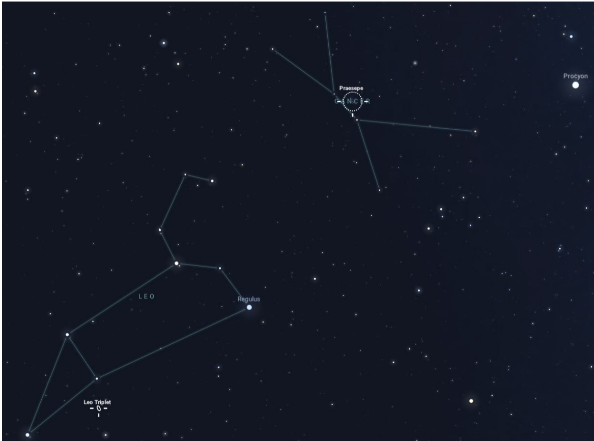
M44 in Cancer and M65 and 66 in Leo can be seen high in the evening sky 60 minutes after sunset.

Stargazers can catalog these items on evenings closest to the new moon. Some even go as far as having “Messier Marathons,” setting up their telescopes and binoculars in the darkest skies available to them, from sundown to sunrise, to catch as many as possible. Here are some items to look for this season: