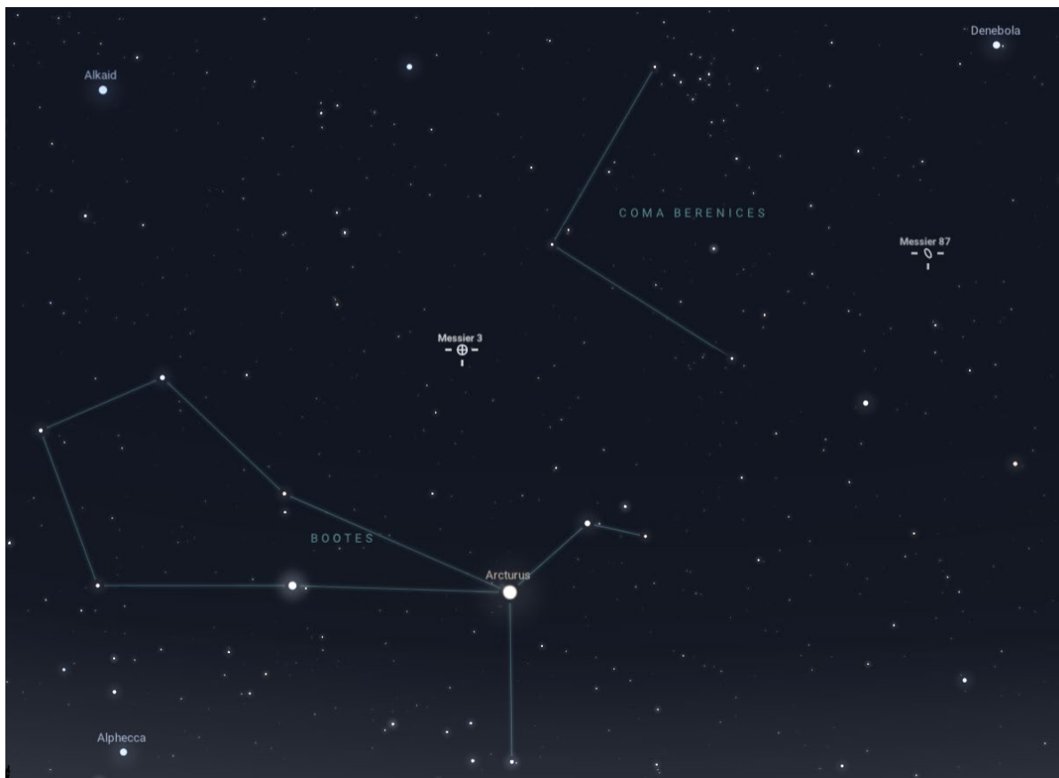
Locate M3 and M87 rising in the east after midnight.

Messier 3 Canes Venatici: M3 is a globular cluster of 500,000 stars. Through a telescope, this object looks like a fuzzy sparkly ball. You can resolve this cluster in an 8-inch telescope in moderate dark skies. You can find this star cluster by using the star Arcturus in the Boötes constellation as a guide.