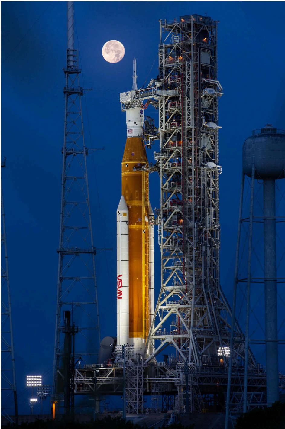
Full Moon over Artemis-1 on July 14, 2022, as the integrated Space Launch System and Orion spacecraft await testing.